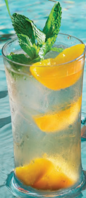
红桃洋甘菊冰茶 PEACH CHAMOMILE