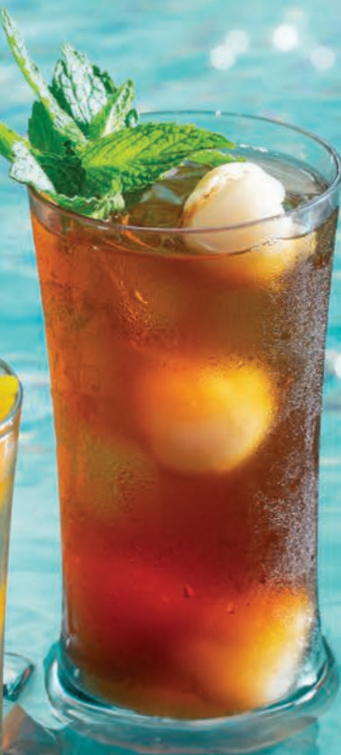
荔枝茉莉花冰绿茶 LYCHEE ICE TEA