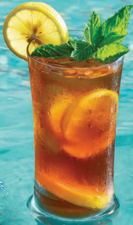
柠檬伯爵冰红茶 LEMON EARL GREY