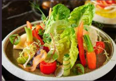
Garden Salad 田园沙律