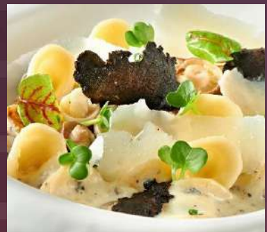
Laksa Linguine King Prawn (additional MOP 30) 叻沙虾扁意粉 (需另加澳門元30)