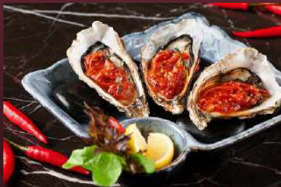
Chili Garlic Baked Fine de Claire Oysters (3 pcs) 香辣蒜蓉烤法国生蚝