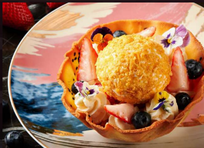
Pairing Drinks 饮品配搭