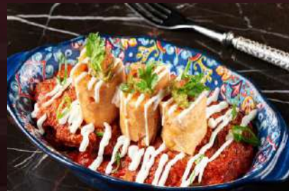
Dry Rubbed BBQ Pork Ribs 香烤猪肋骨 Cojun Coleslaw