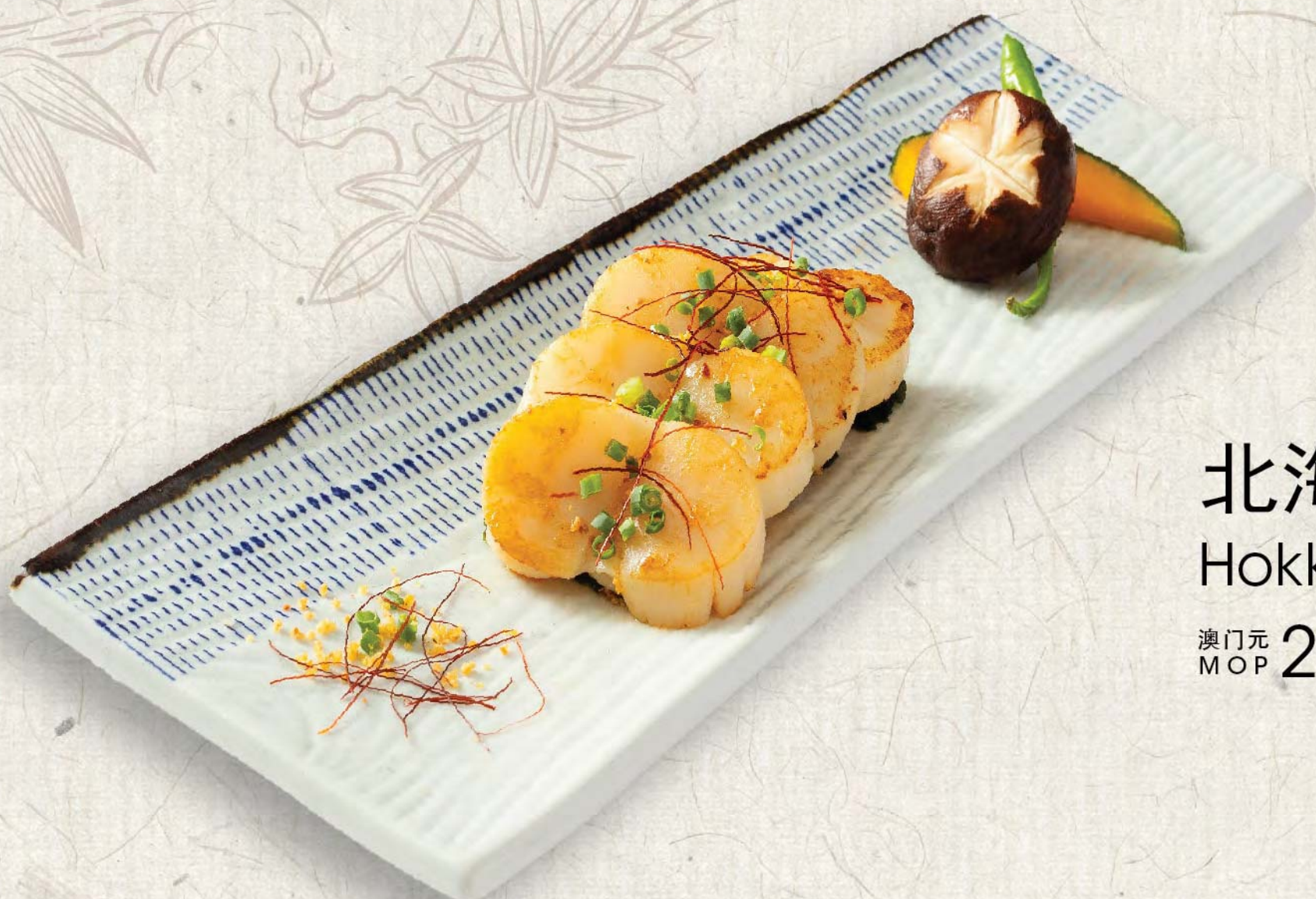
北海道带子 (4只) Hokkaido Scallops (4 pcs)