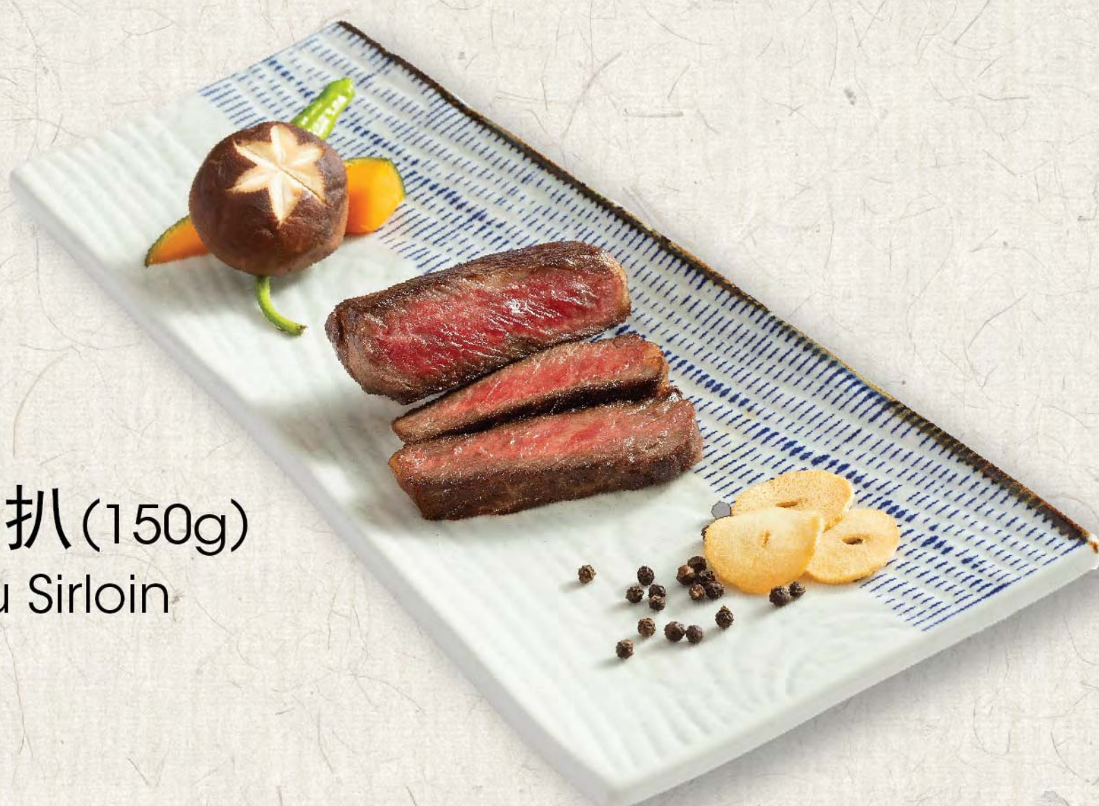
M6但马澳洲和牛西冷扒(150g) M6 Tajima Australian Wagyu Sirloin