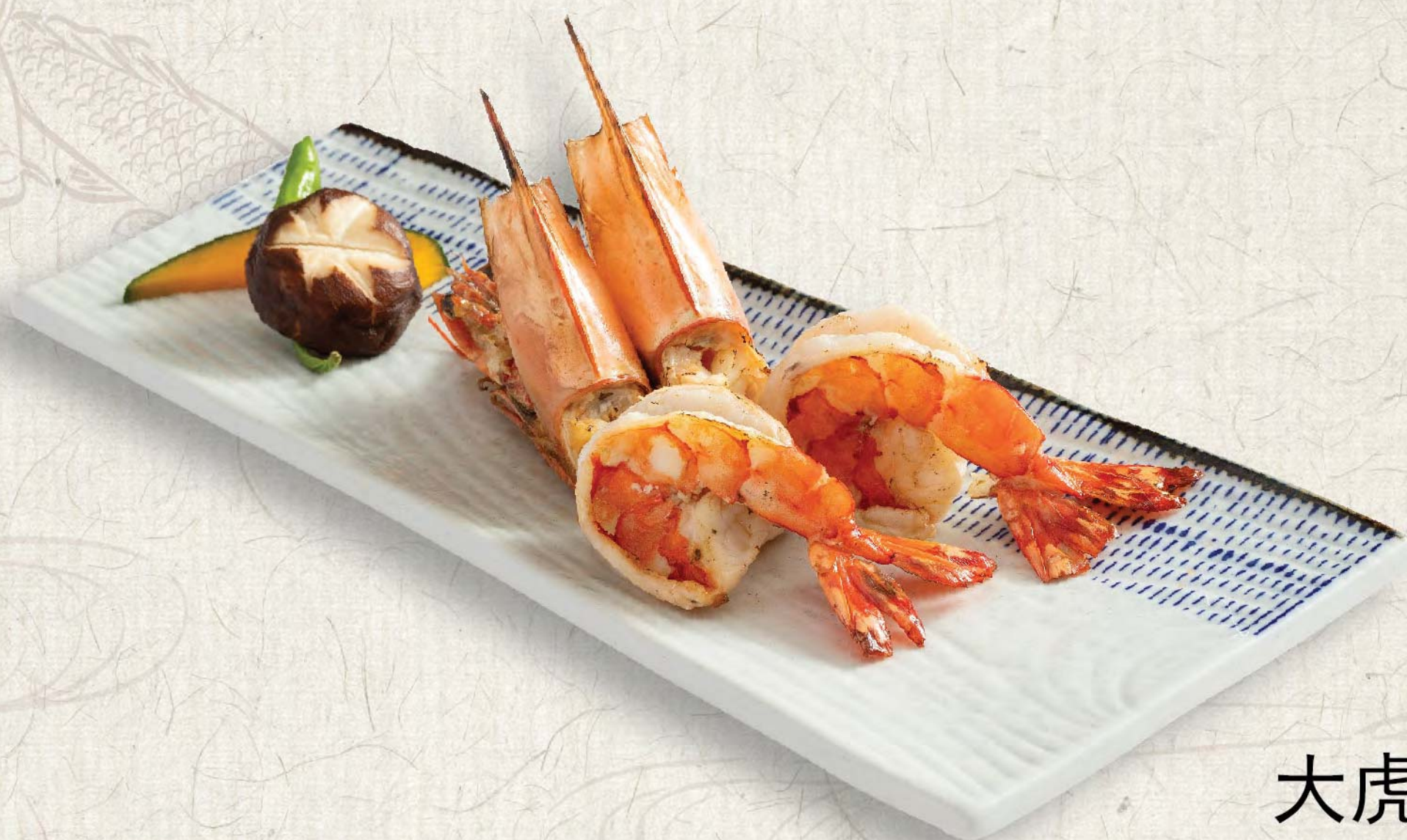
大虎虾 (2只) King Prawns (2 pcs)