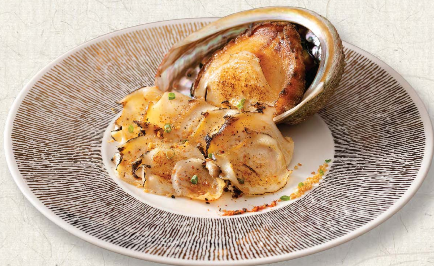
澳大利亚活鲍鱼 Fresh Australian Abalone