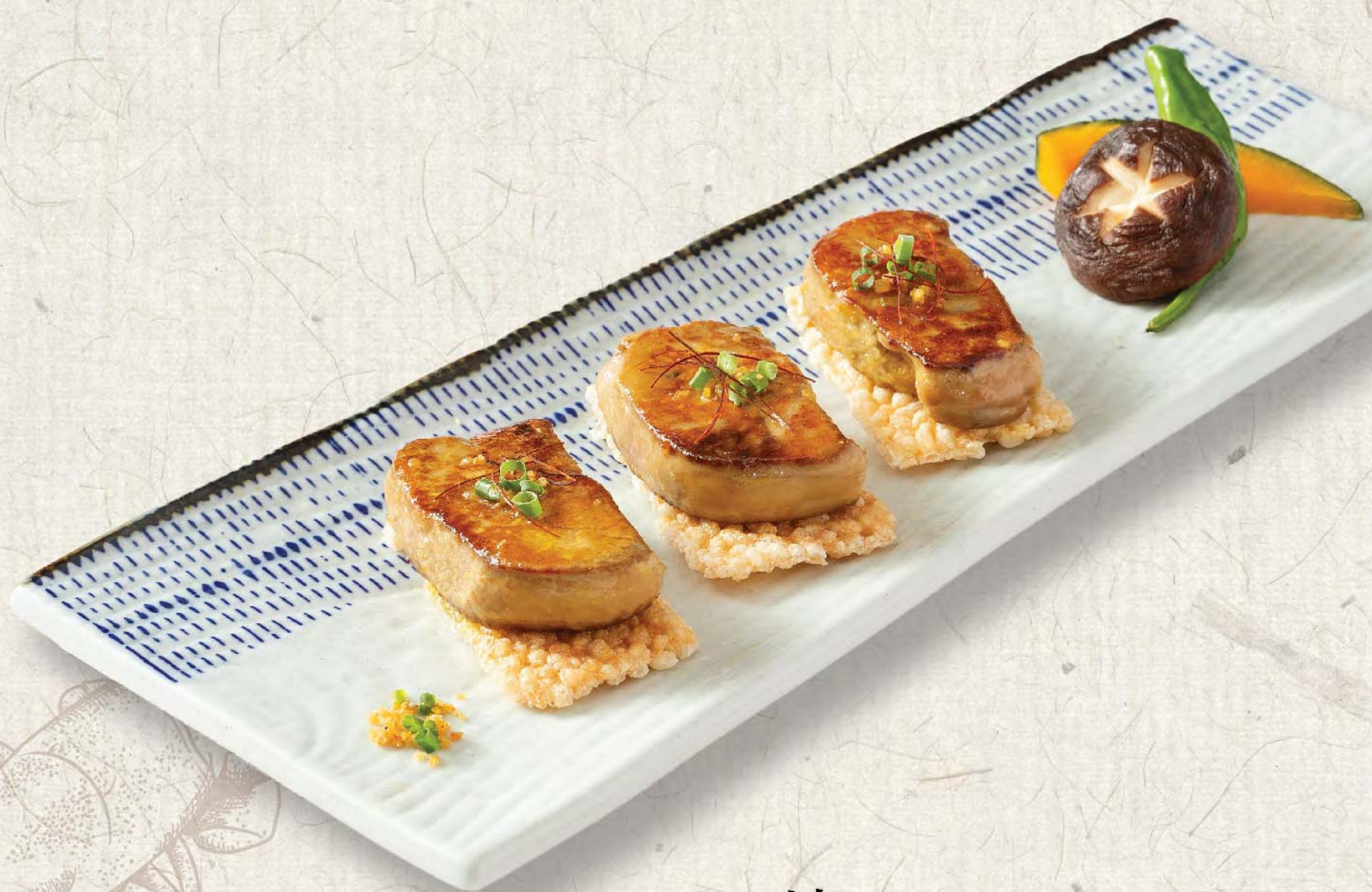
鹅肝 (3件) Foie Gras (3 pcs)