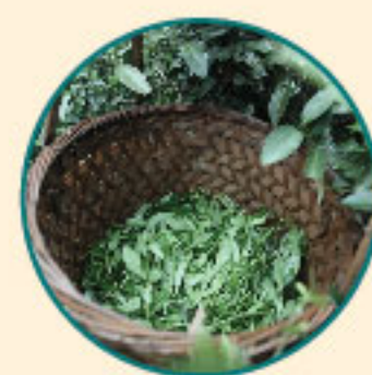
2 武夷山 大红袍