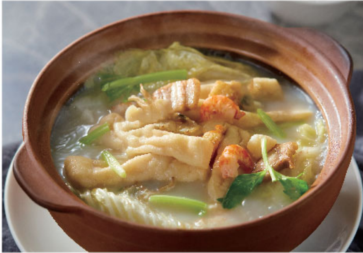
大白菜炖软豆腐 Braised Bean Curd with Chinese Cabbage