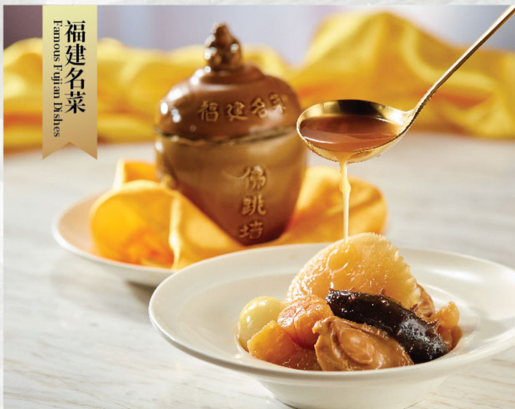
经典佛跳墙 Traditional Buddha Jumps Over the Wall