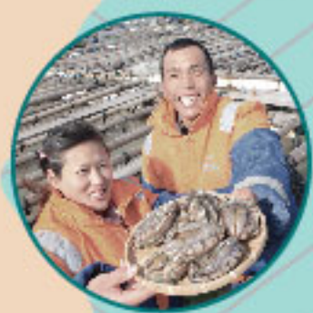
11 莆田南日岛 南日鲍