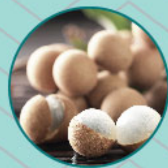
16 (四大名果) 莆田市 老树龙眼