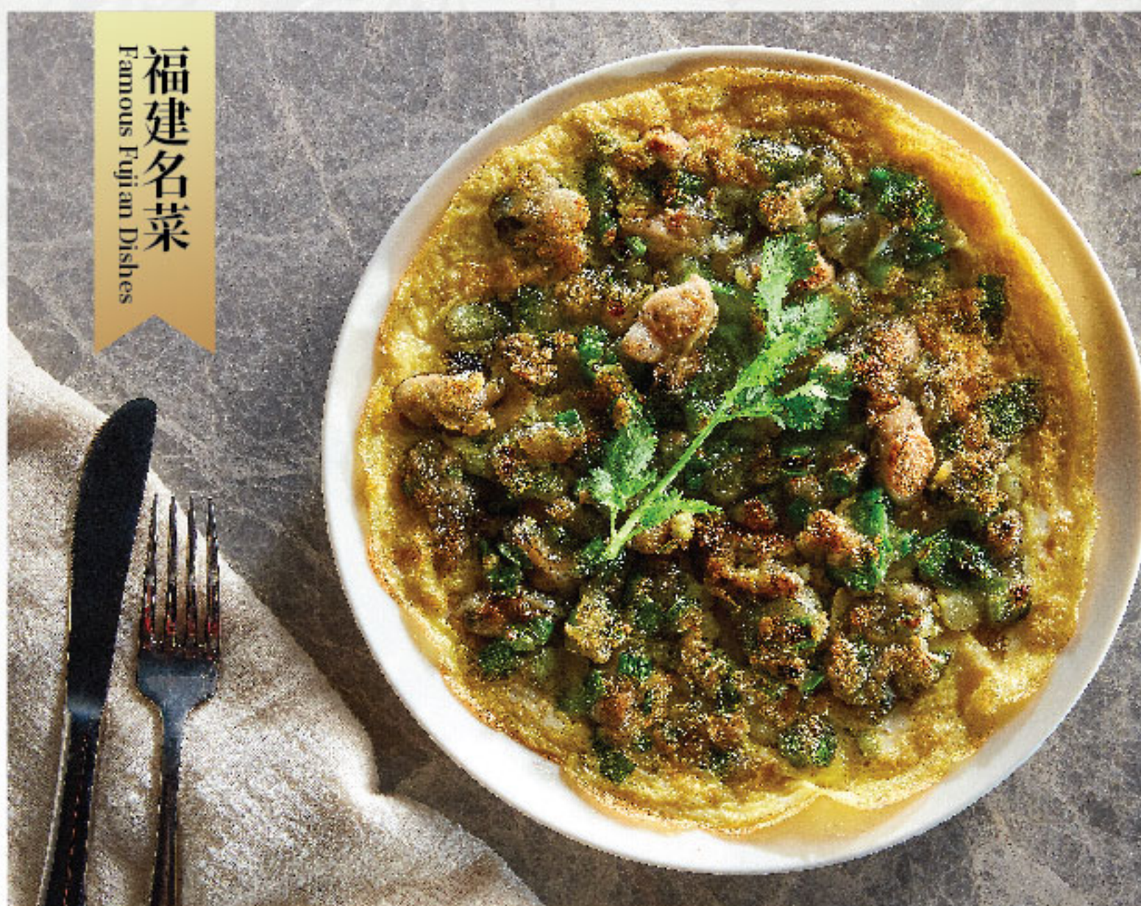
福建特色海蛎煎 Fujian Fried Oyster Omelette