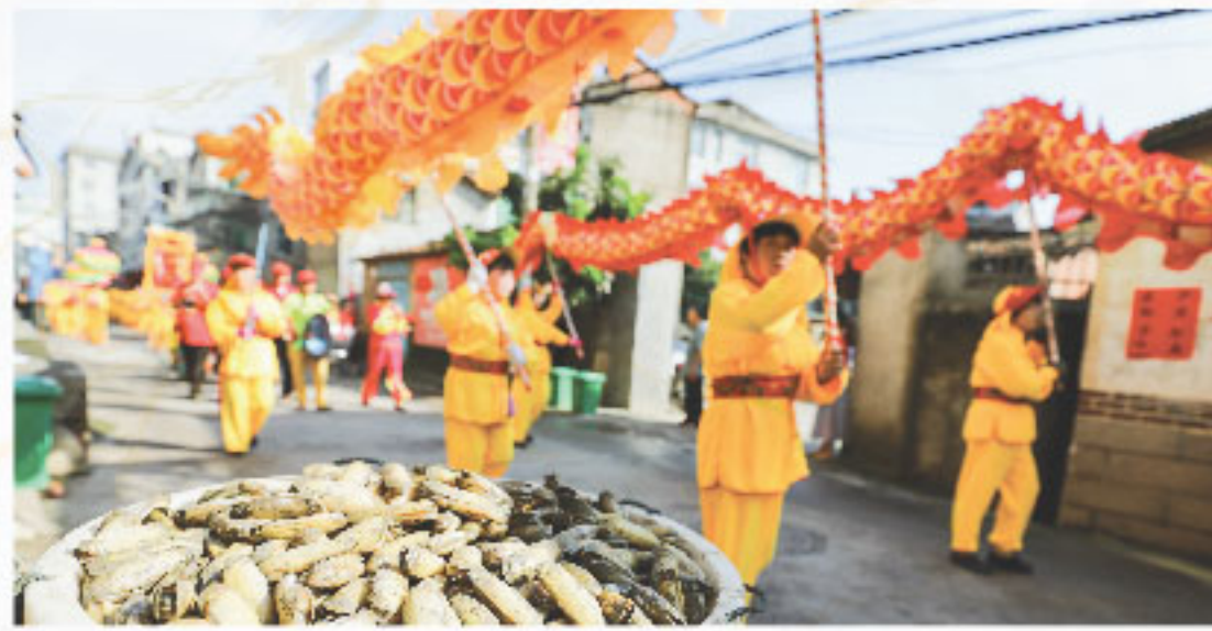
蛭田播撒圣水, 祈祷哆头蛭肥美丰收 Sowing "holy water" in the razor clam field and praying for a bountiful harvest of succulent Duotou clams.