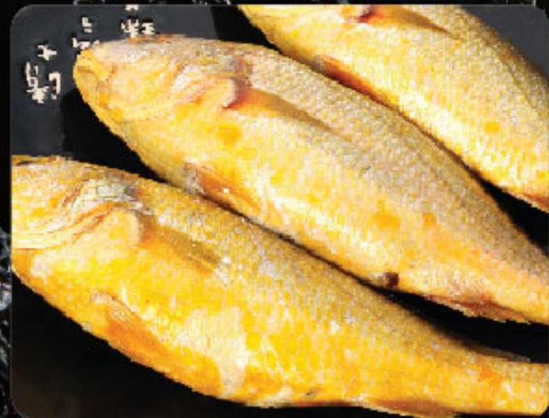
只有深夜捕捞的黄花鱼, 鱼肚才是金黄色 Only yellow croakers caught at midnight have golden maws.