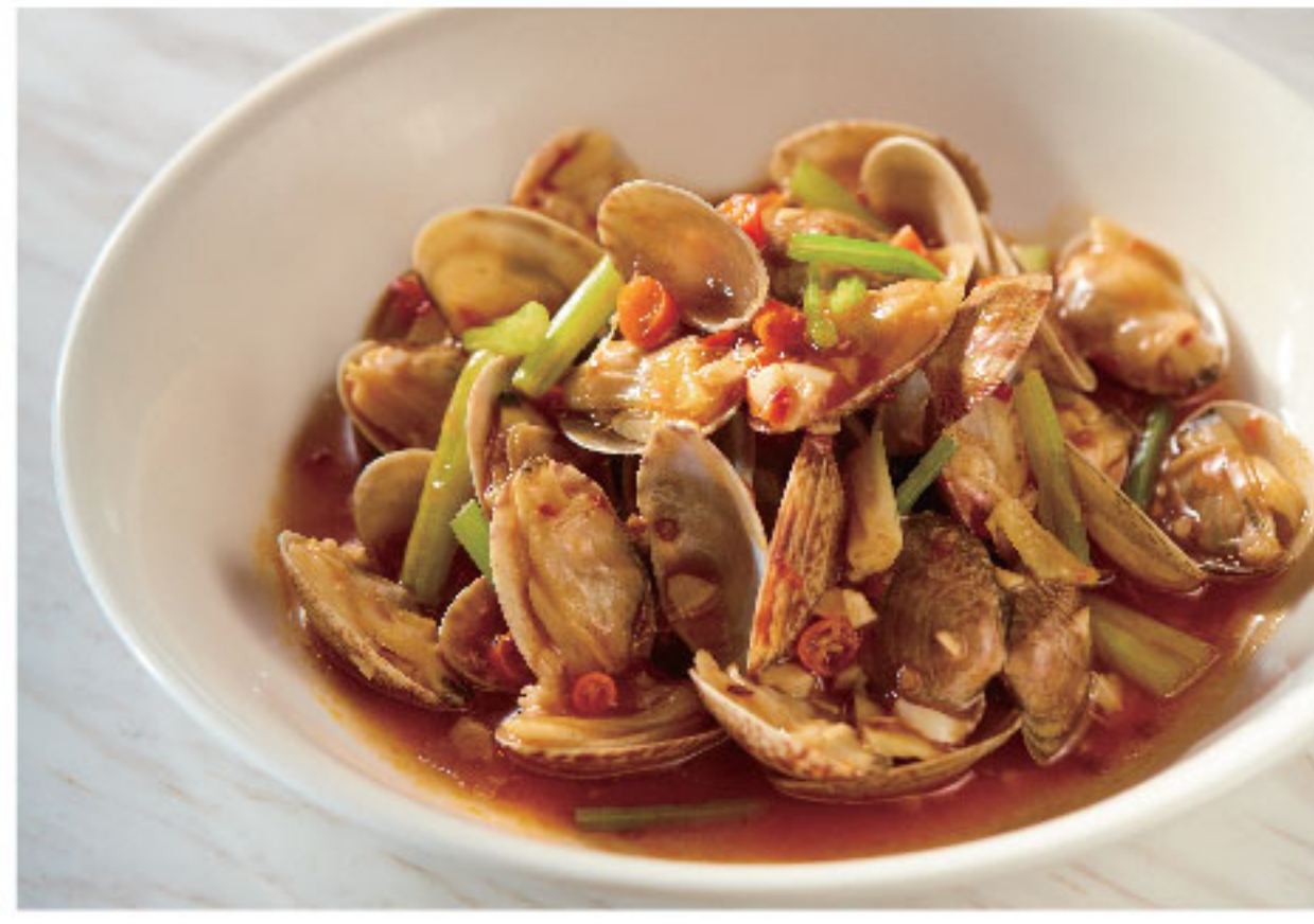
辣汁花蛤 Stir-fried Chilli Clams