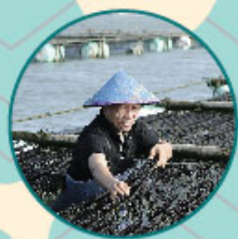
12 莆田东海沿线 头水紫菜