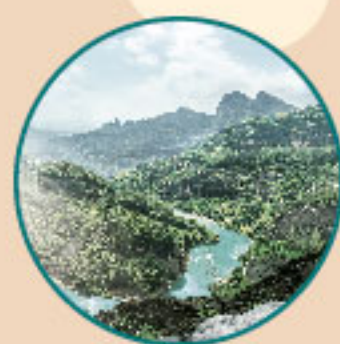
1 武夷山 武夷峰山泉

莆田鲜海蛎, 越吃越蛎害 古法晒海盐, 技艺上千年 莆田红菇鲜, 原味出深山 兴化炒米粉, 地道妈祖面 传统手工艺, 百年名特产 寻找好食材, 上山又下海 苦练数十载, 掌握好食材