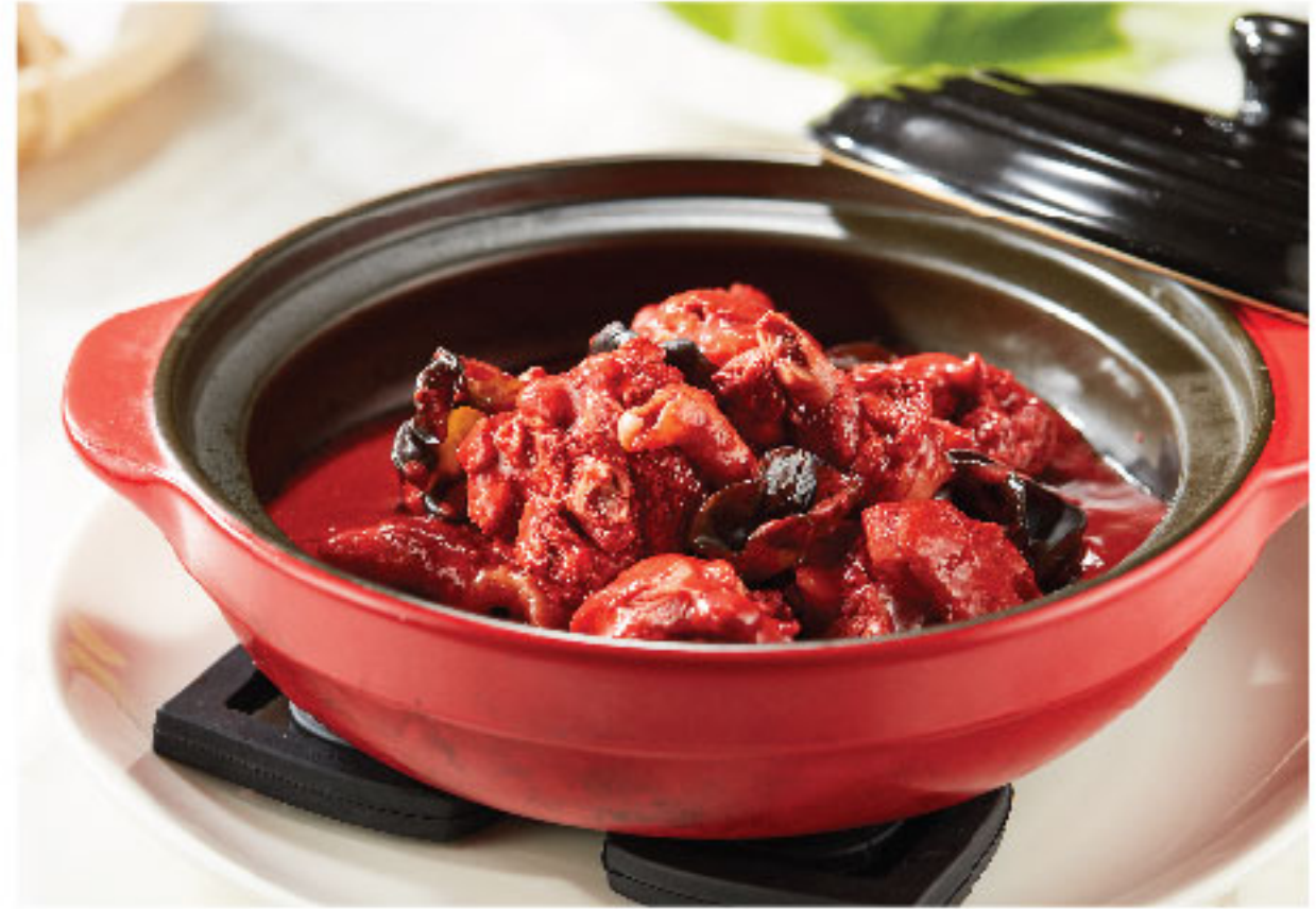
福州风味红糟鸡 Claypot Chicken in Fermented Red Rice Wine