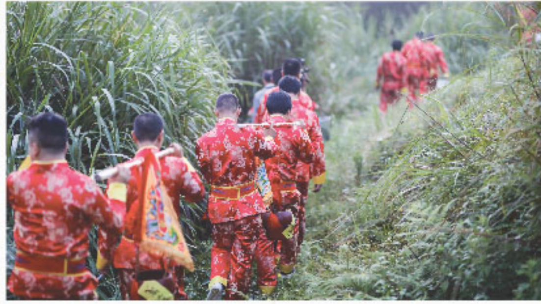
大街小巷锣鼓齐鸣, 圣水巡游 A triumphant parade celebrating the arrival of the "holy water".