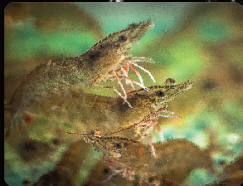
只吃天然海捕小鱼虾长大 Fed only on small fishes and shrimps caught from the sea.