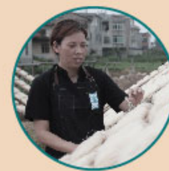
7 莆田黄石镇 兴化米粉