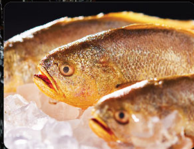
冰鲜到店, 从原产地到餐厅 Chilled and delivered from source to restaurant.