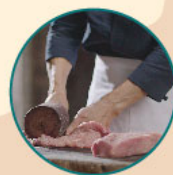
4 莆田涵江厚峰村 手打扁肉