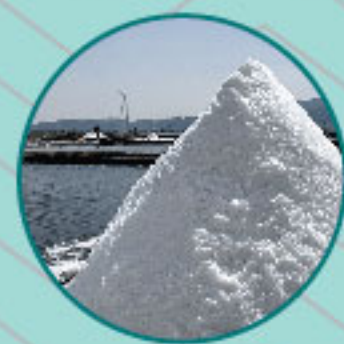
13 莆田市 福建海盐