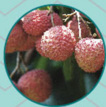
15 (四大名果) 莆田市 老树荔枝