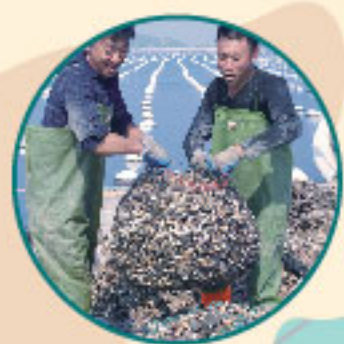
8 莆田江口镇 江口海蛎