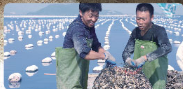
海蛎产地: 福建兴化湾江口港 Origin of oysters: Jiangkou Port, Xinghua Bay, Fujian.