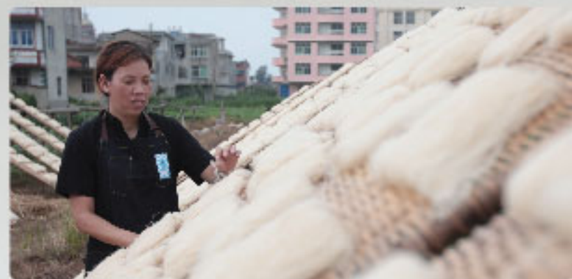
兴化米粉产地:莆田黄石镇 Origin of Heng Hwa Bee Hoon: Huangshi Town, Putian.