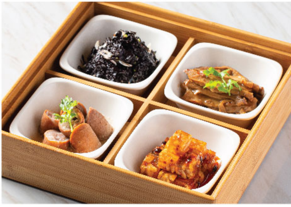
精美四小拼 Starters Platter