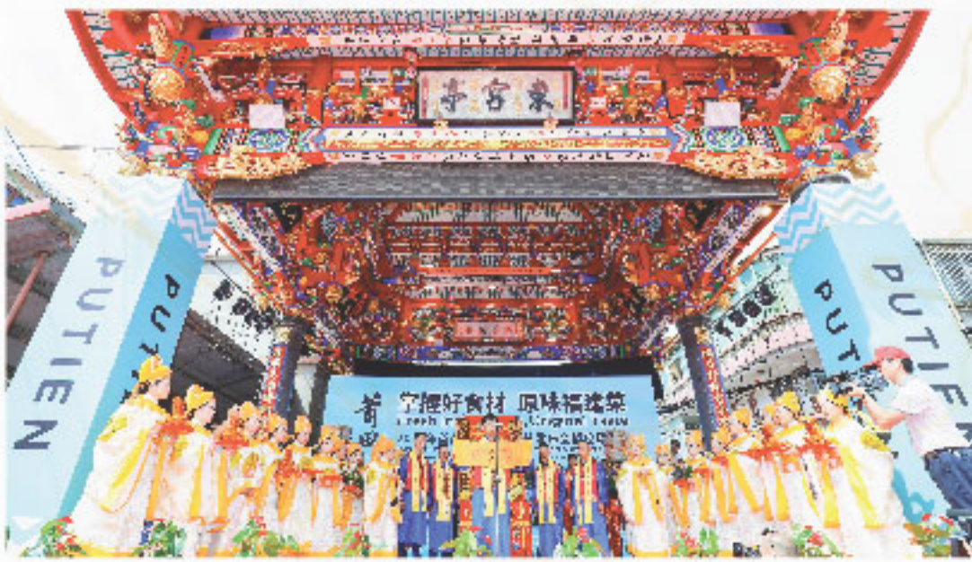
依古礼, 圣水祭祀祈福大典 Performing the "holy water" ritual In accordance with ancient times.