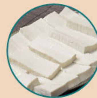
5 莆田市 盐卤豆腐