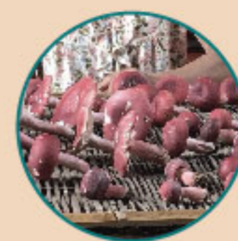
3 福建边远山区, 长汀 红菇