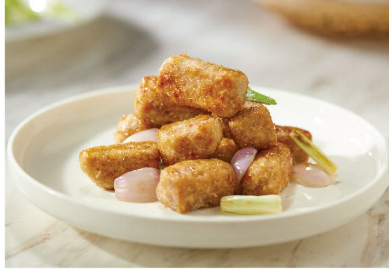
酥炒芋芯 Stir-fried Yam

澳門元 MOP 58 件(pc) 2件起售 (Minimum order 2 pcs)