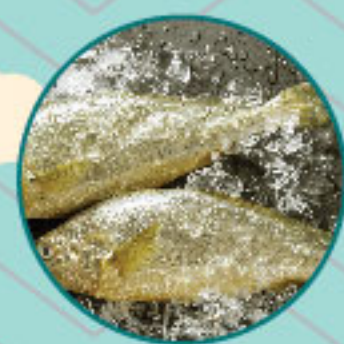
10 中国黄花鱼之乡——福建宁德 宁德黄花鱼