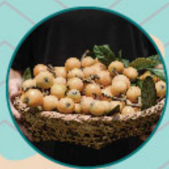
14 (四大名果) 莆田仙游县 老树枇杷