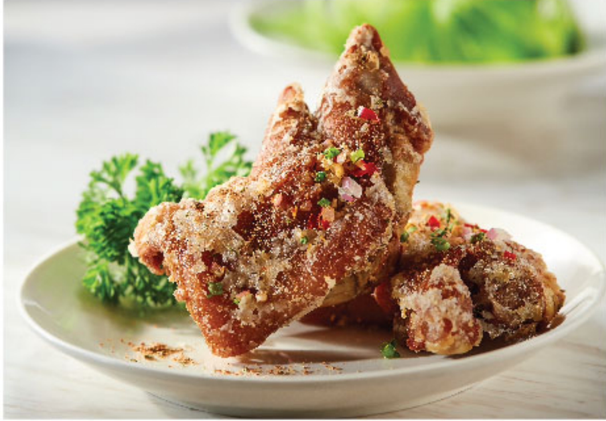
椒盐猪手 Deep-fried Pork Trotters with Salt & Pepper

澳門元 MOP 58 件(pc) 2件起售 (Minimum order 2 pcs)