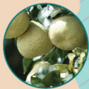
17 (四大名果) 莆田仙游县度尾镇 老树文旦柚