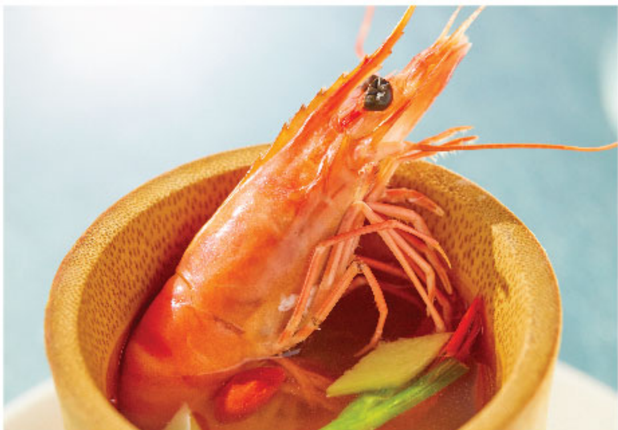
酒香竹筒虾 Herbal Prawn