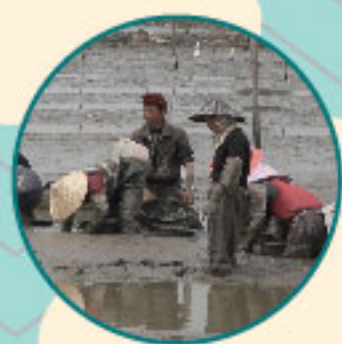
9 莆田三江口镇哆头村 哆头蛎