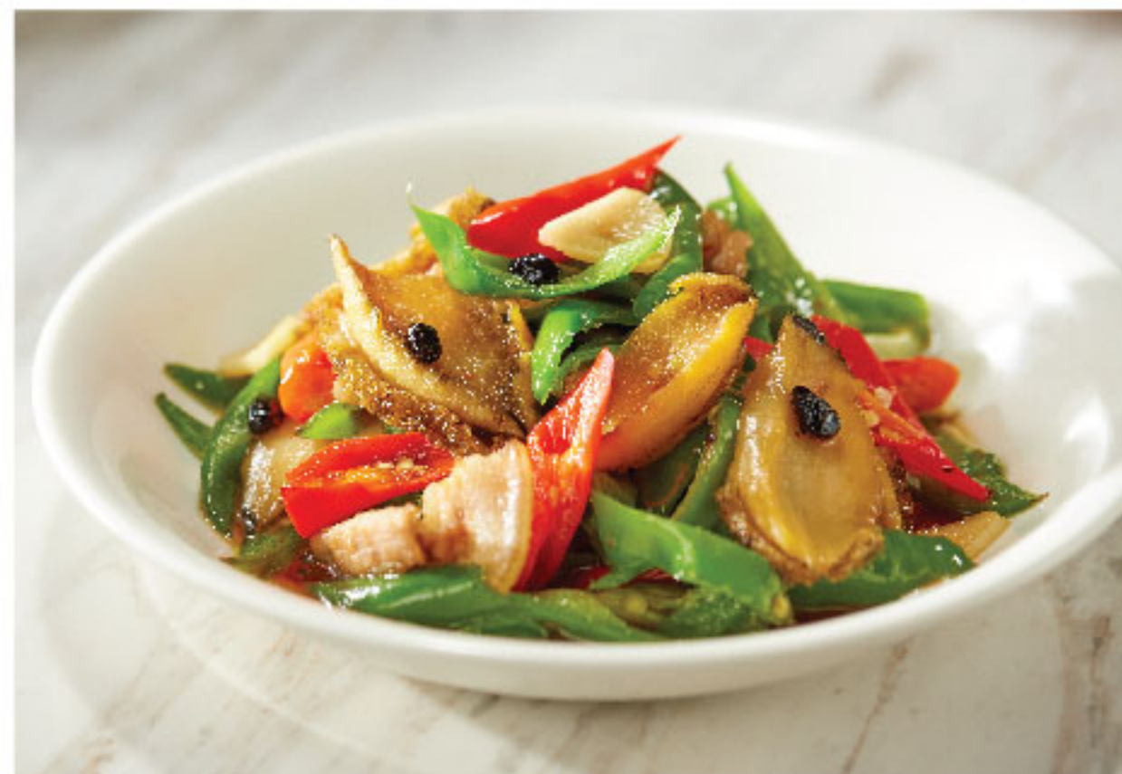
鲍鱼辣椒小炒肉 Stir-fried Spicy Abalone and Pork