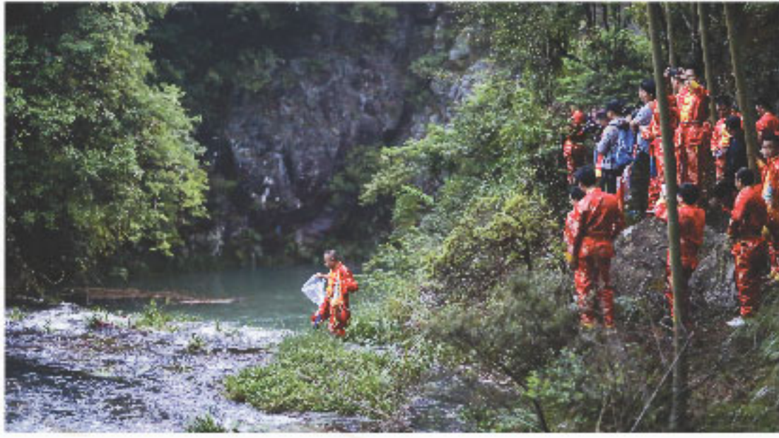
凌晨, 兴角山蛭池取圣水 Fetching the "holy water" from Xingjiao Mountain during wee hours.

When the razor clam sowing or harvest season arrives, razor clam farmers will travel up to the Xingjiao Mountain overnight to pray for "holy water", They will then bring the "holy water" back and sprinkle it on their razor clam fields, praying for an eternal good harvest of razor clams. Till today, farmers from the Duotou Villages still carry out this traditional practice, with the "razor clam pond" thriving in abundance.