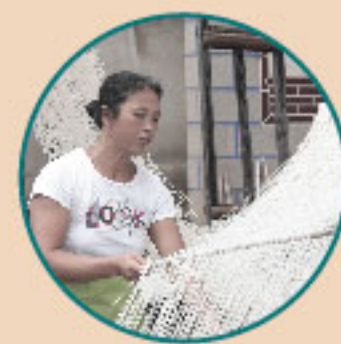
6 莆田黄石镇 妈祖面线