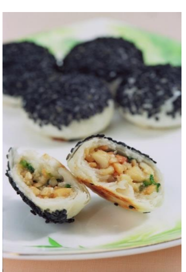
所有以澳門幣價目已包含 10%服務費 All Prices in MOP inclusive of 10% Service Charge